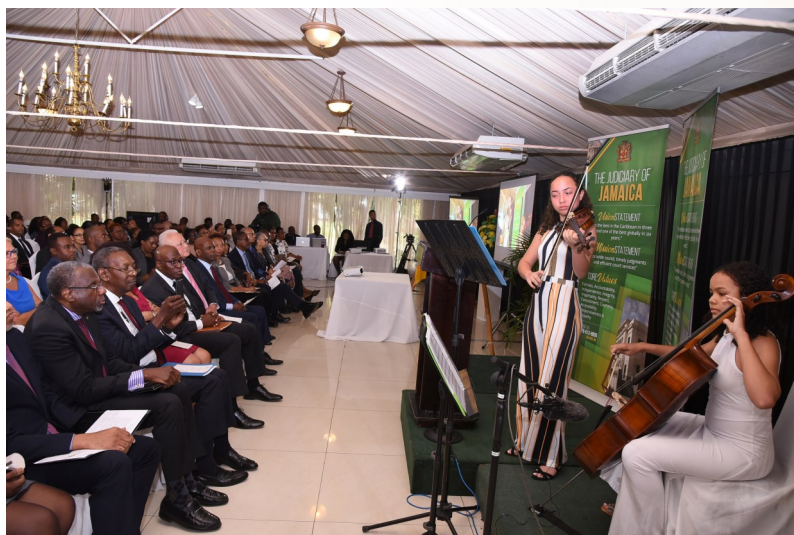
These talented violinists entertained the guests at the unveiling of the Judiciary's Strategic Plan at the Terra Nova All-Suite Hotel in St. Andrew on January 31, 2020.