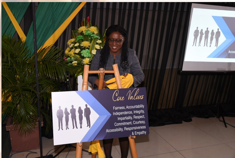
PHOTO HIGHLIGHTS FROM STRATEGIC PLAN LAUNCH