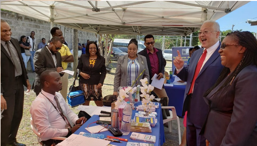
PHOTO HIGHLIGHTS FROM ST. THOMAS PARISH COURT PUBLIC EDUCATION DAY

Staff members from the Court Administration Division engaged in a conversation with Justice Minister the Honourable Delroy Chuck at the National Public Education Symposium held at the St. Thomas Parish Court on January 22, 2020.