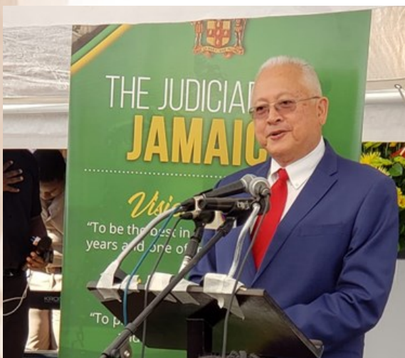
PHOTO HIGHLIGHTS FROM ST. THOMAS PARISH COURT PUBLIC EDUCATION DAY

Justice Minister the Honourable Delroy Chuck addresses the audience at the National Public Education Symposium at the St. Thomas Parish Court in Morant Bay, St. Thomas on January 22, 2020.