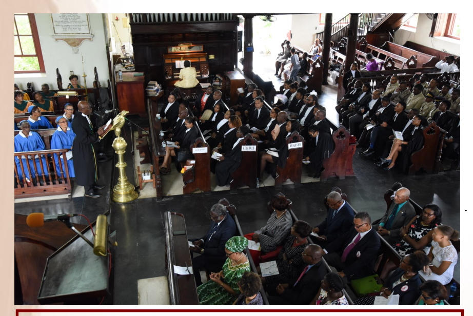
Members of the congregation at the Assize Service held at the St. James Parish Church in Montego Bay.