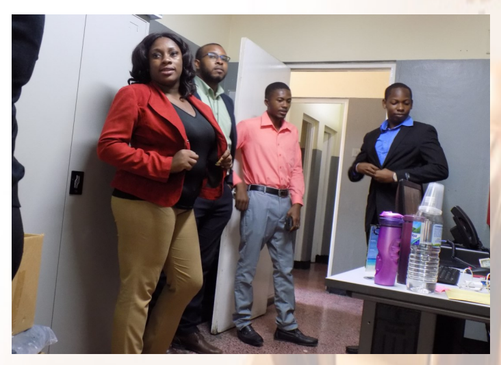
Staff members of the Traffic Court participating in HR-Day exercise in Kingston.