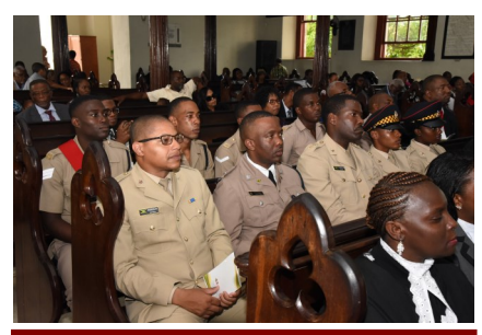
Members of the Jamaica Combined Cadet Force in attendance at the Assize Service.