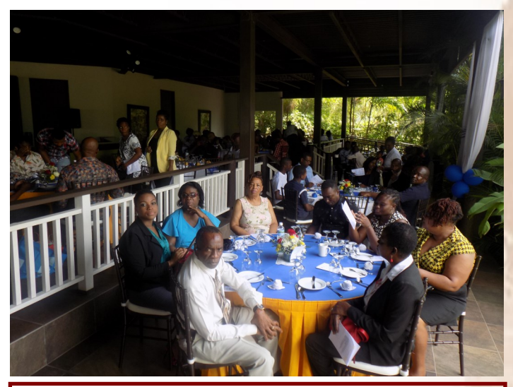
Parents and graduates at the Drug Treatment Court graduation ceremony held at the Empowerment Park, Juici Patties' Head Office in Clarendon on July 16, 2019.