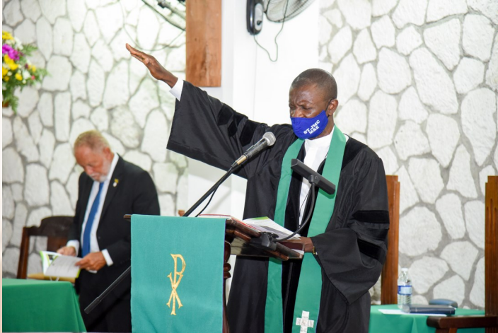
PHOTO HIGHLIGHTS - ASSIZE SERVICE