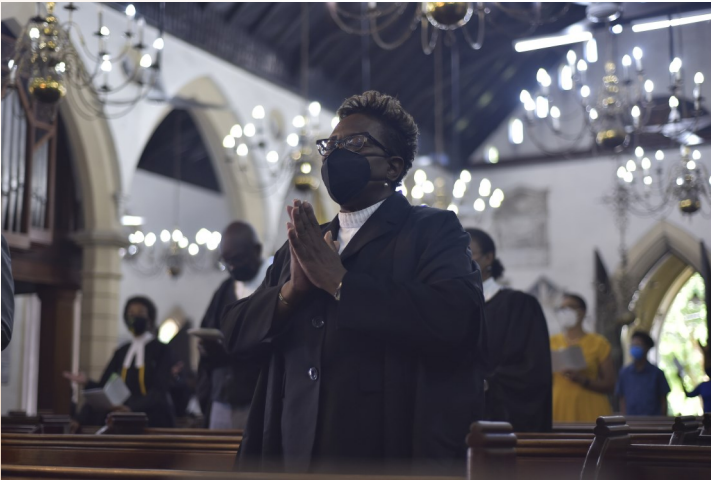
PHOTO HIGHLIGHTS - ANNUAL ASSIZE SERVICE