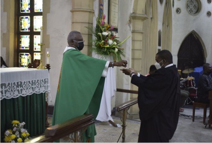
PHOTO HIGHLIGHTS - ANNUAL ASSIZE SERVICE