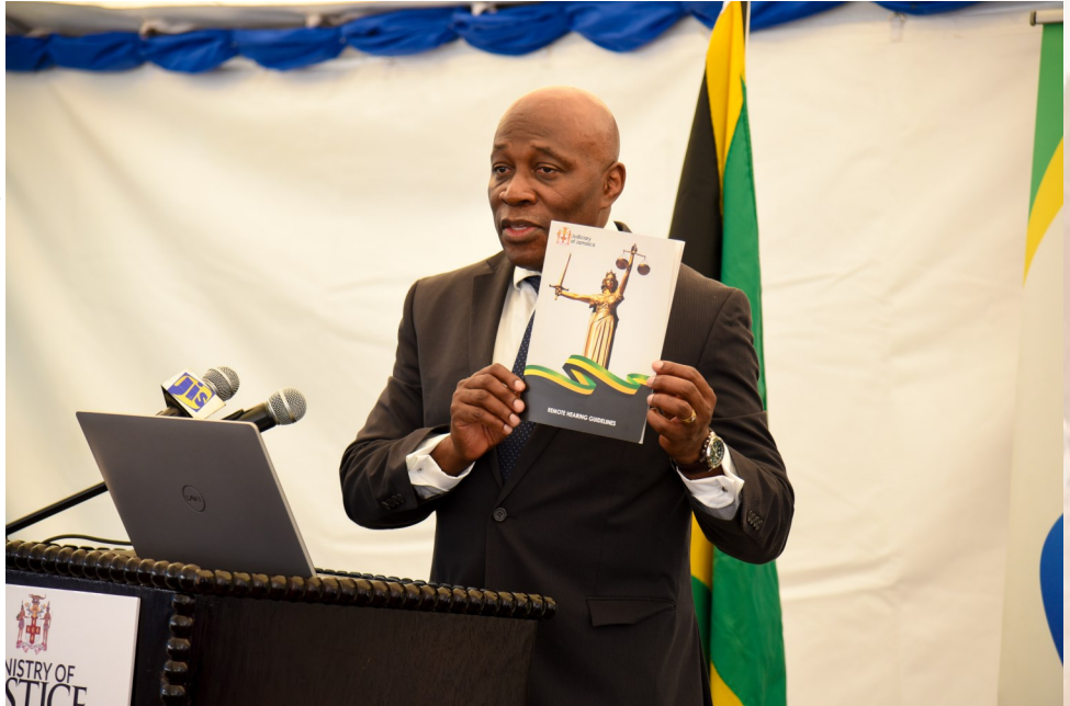
Chief Justice the Honourable Mr. Justice Bryan Sykes, OJ, CD showing the audience a copy of the Judiciary's Remote Hearing Guidelines at a handover ceremony for two mobile units at the Ministry of Justice in St. Andrew on Friday, November 5, 2021. The buses retrofitted with audio-visual technology will allow for vulnerable witnesses to give their testimonies remotely.

Chief Justice Sykes launched the Remote Hearing Guidelines at a handover ceremony for two mobile buses retrofitted with audio-visual technology to hear testimonies from witnesses remotely. The units were handed over to the Court Administration Division at the Ministry of Justice offices in St. Andrew on Friday, November 5, 2021.