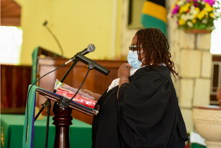
PHOTO HIGHLIGHTS -ASSIZE SERVICE